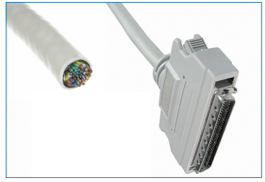
Punch Down Cable

IP/IPX over Frame Relay/ PPP/HDLC/X.25, X.25 over Frame Relay (Annex G), BSC over X.25, SNA over X.25, PPPoE, PPPoA, IP over ATM